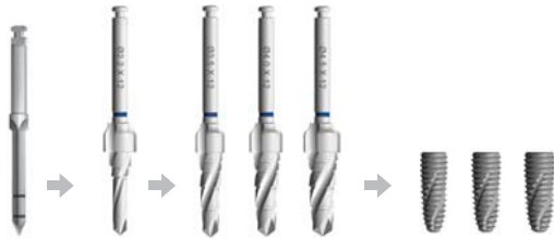
Ø2.2 Initial Drill과 Final Drill를 이용한 간단한 Drill sequence (Ø3.5 / 4.0 / 4.5 fixture)